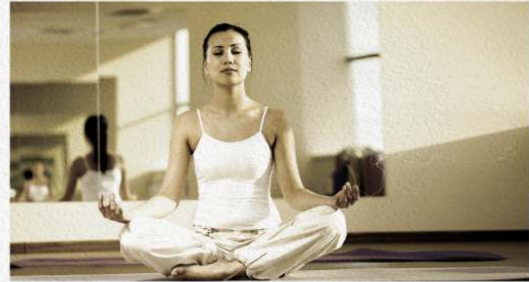
Yoga & Meditation Room