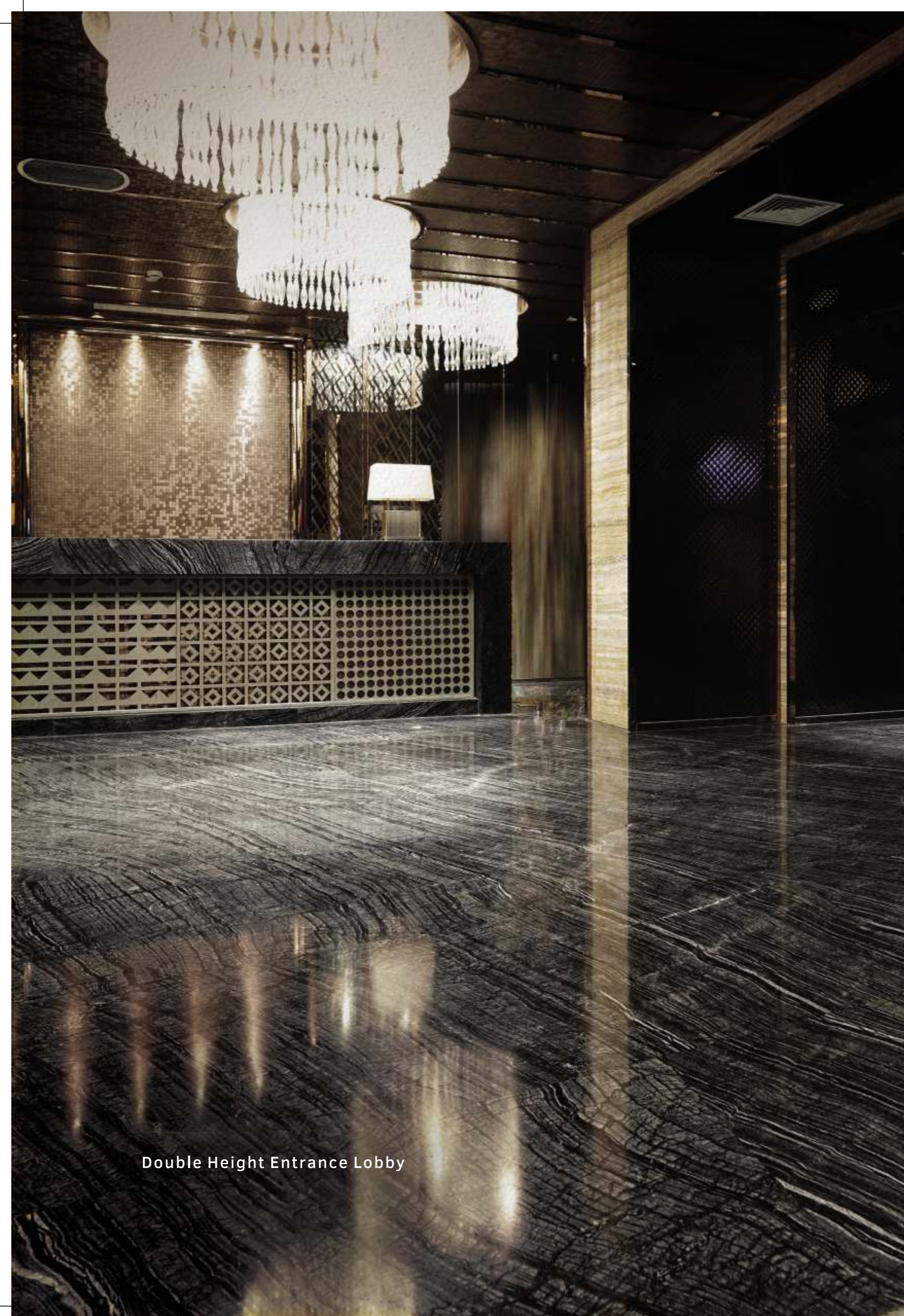
Double Height Entrance Lobby