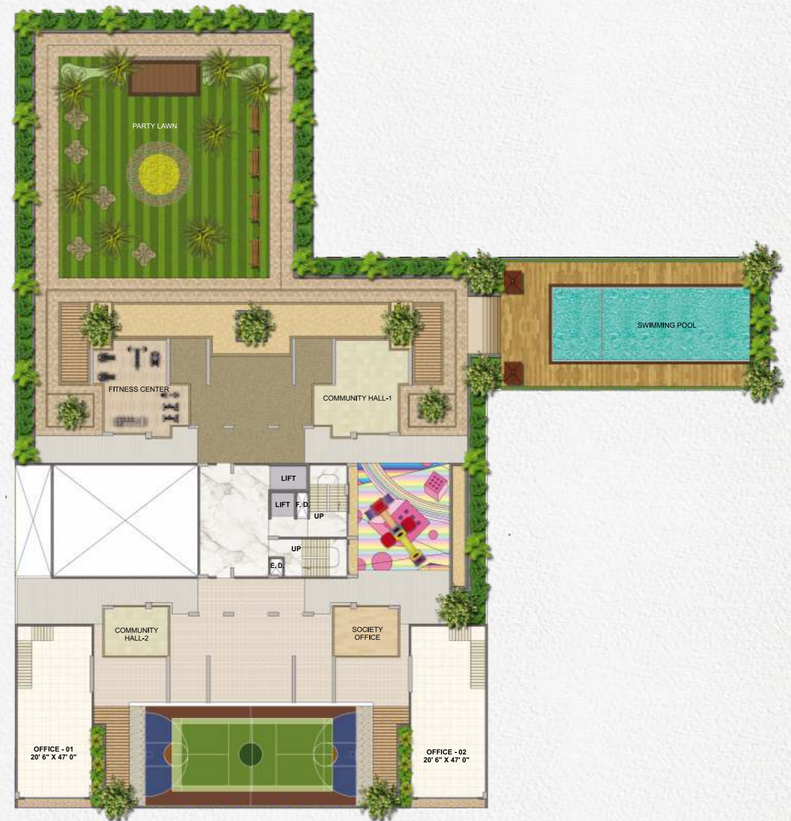
CLUBHOUSE INDULGENCES On 1st floor