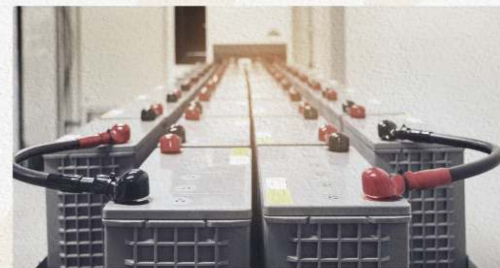
Power Backup for Common Utilities