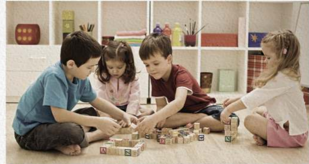
Toddlers Hobby Room