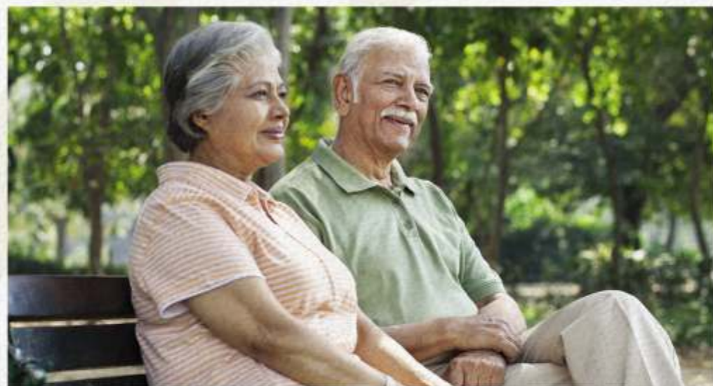
Senior Citizen's Zone with Sit-outs