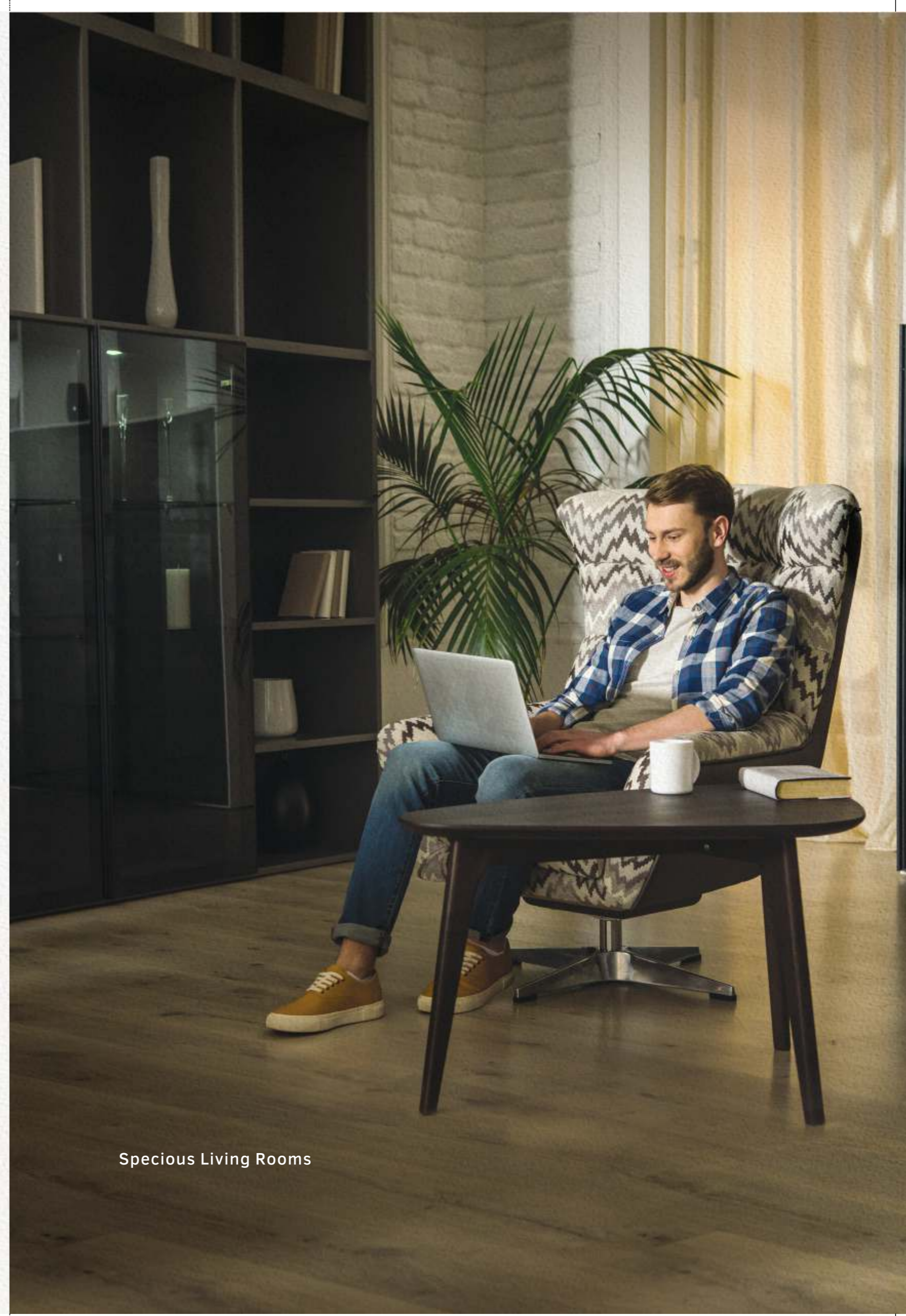
Spacious Living Rooms