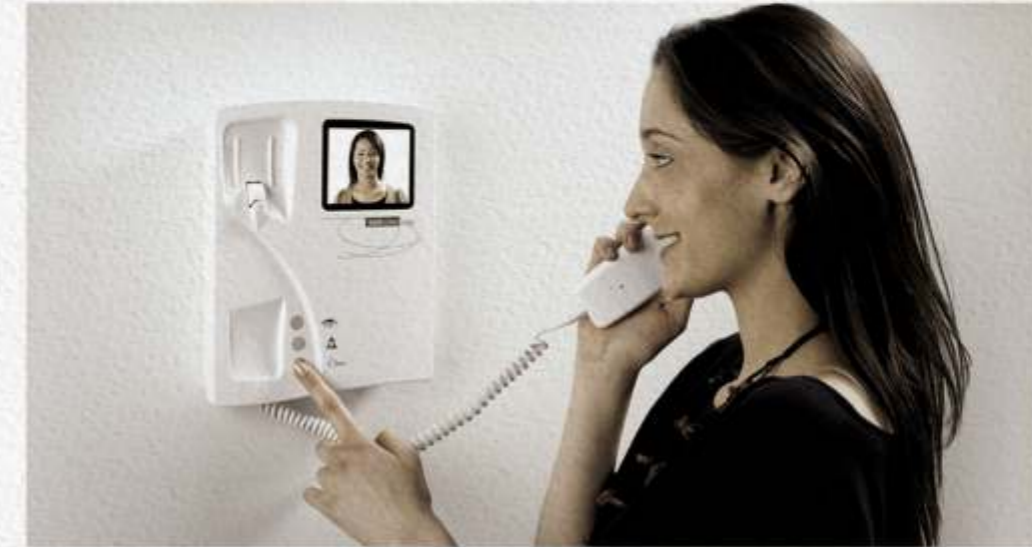
Video Door Security Systems