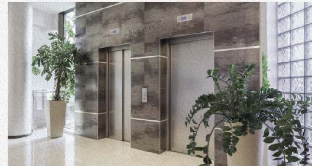
Hi-Speed Branded Elevators