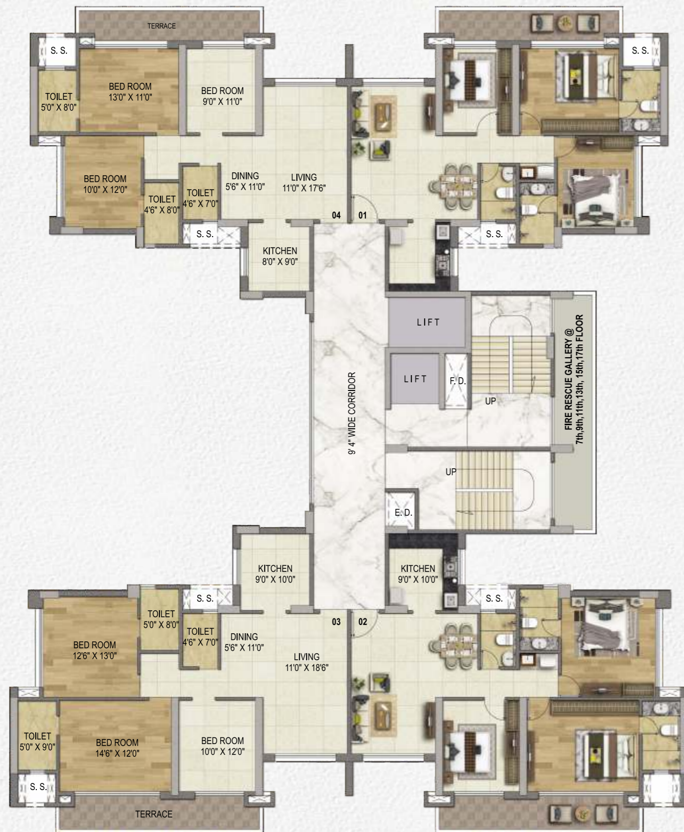
Typical odd Floor Plan