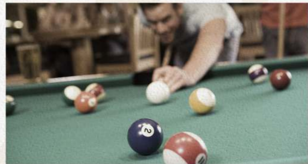
Indoor Games Arcade