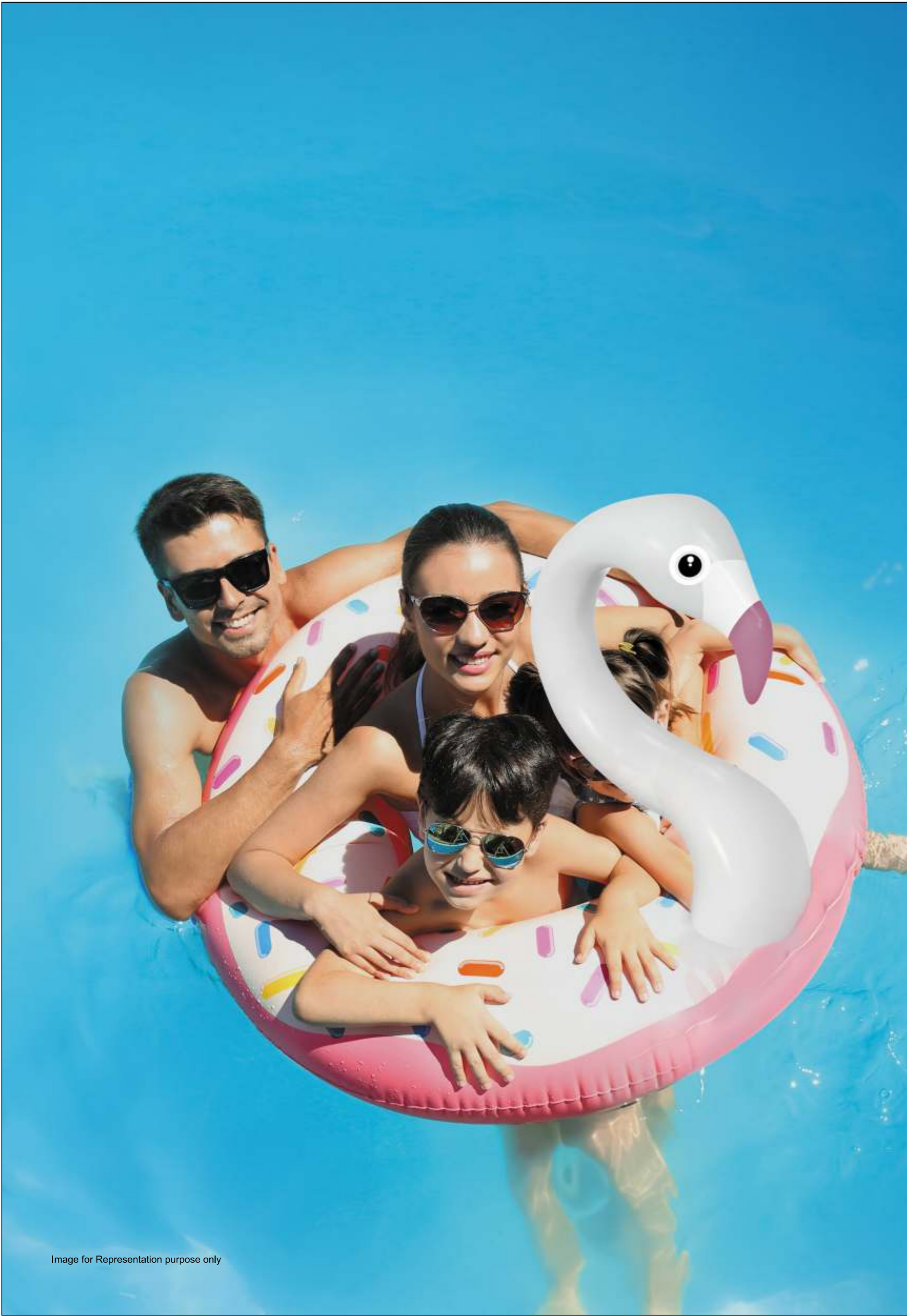
Image for Representation purpose only