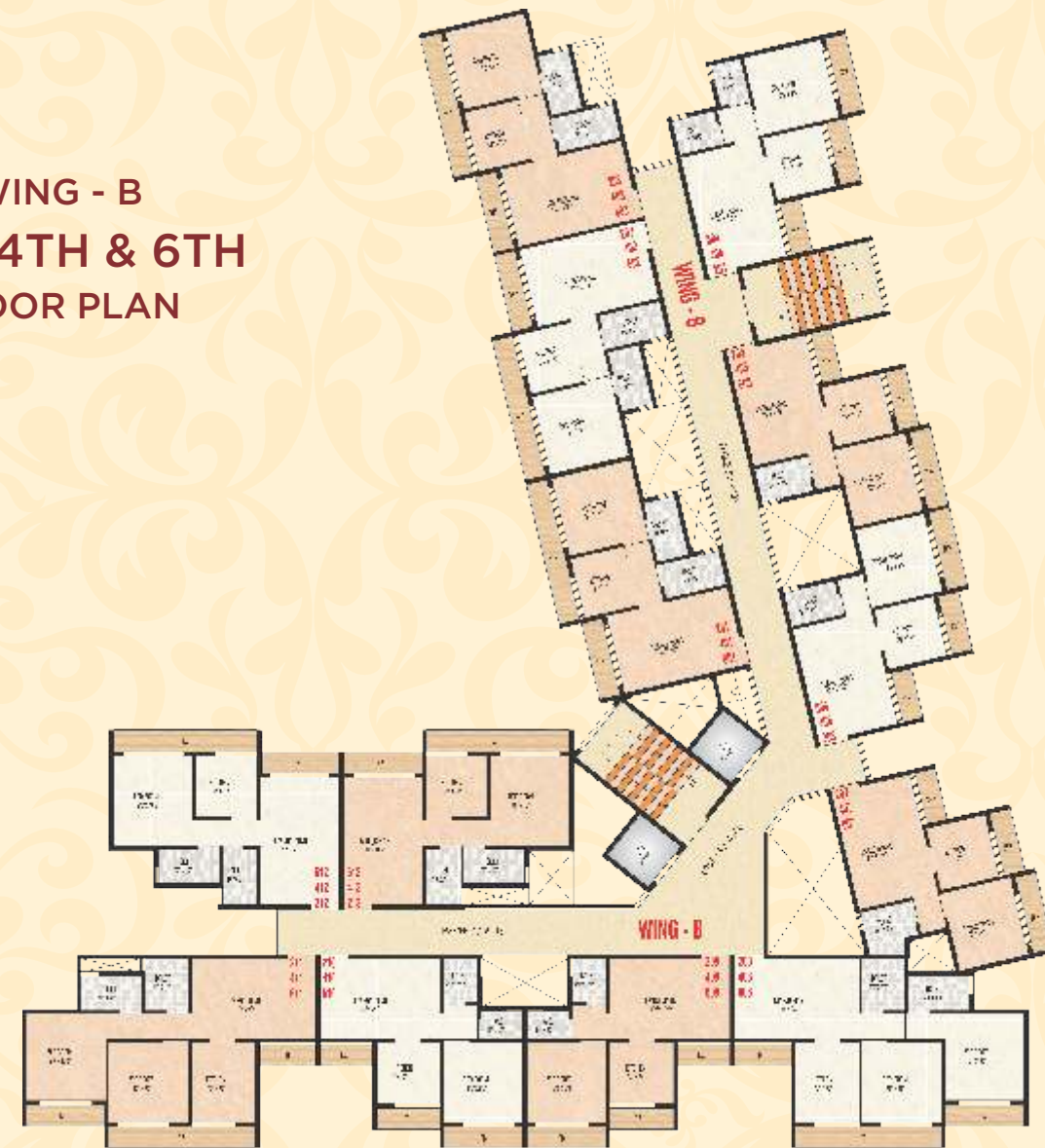
WING - B 2ND, 4TH & 6TH FLOOR PLAN