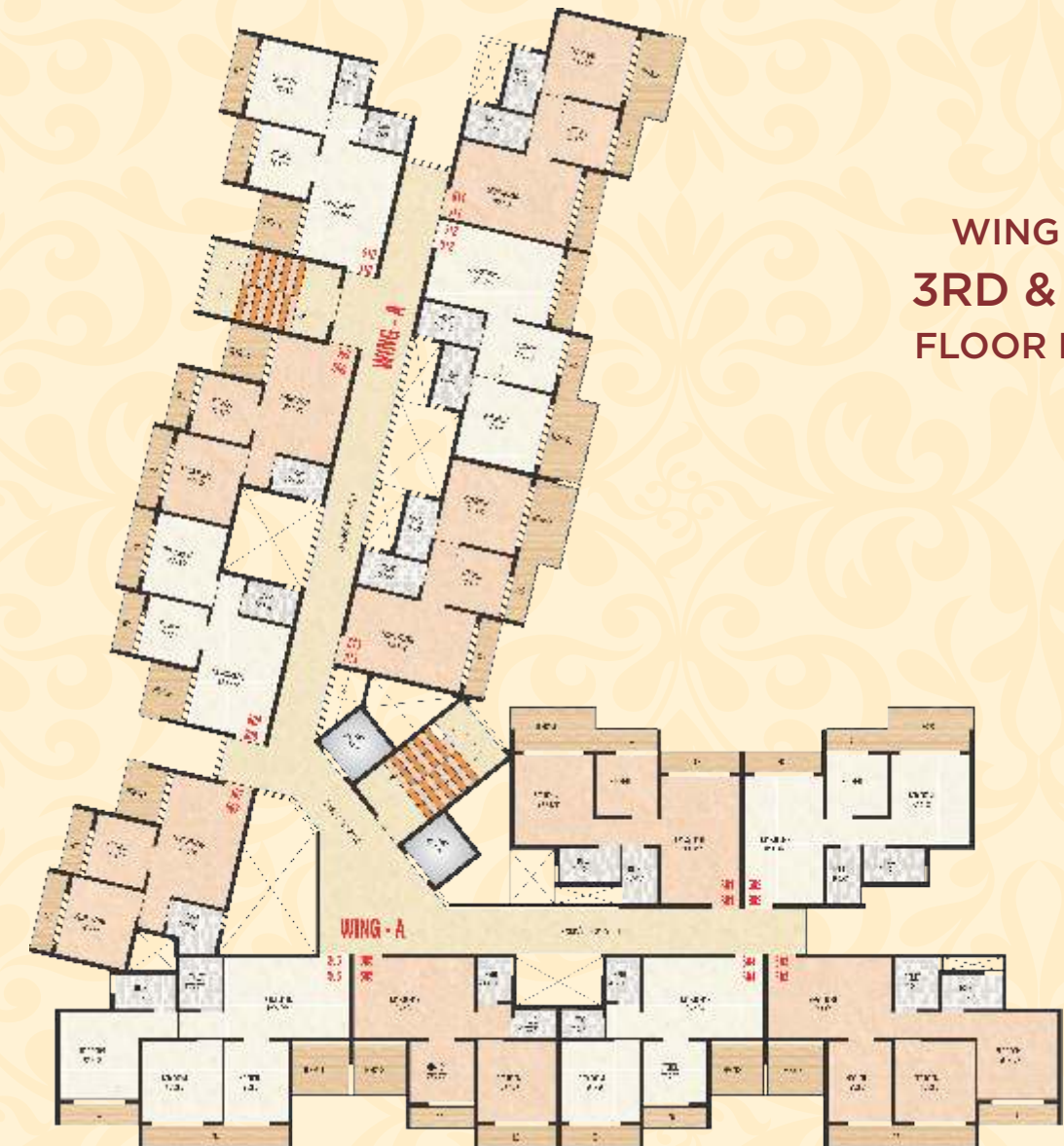
WING - A 3RD & 5TH FLOOR PLAN