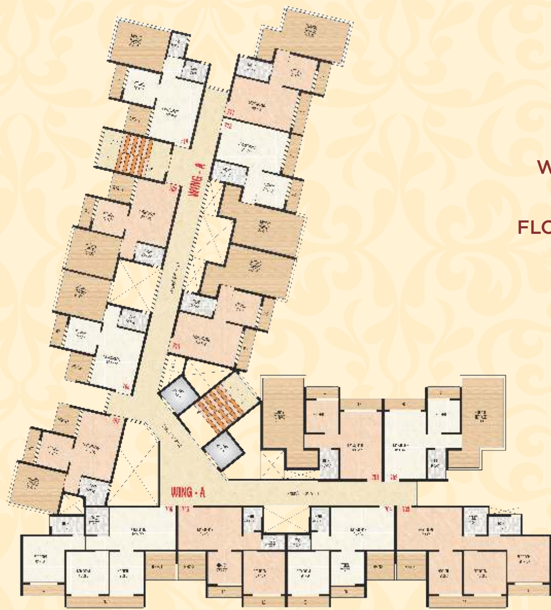
WING - A 7TH FLOOR PLAN