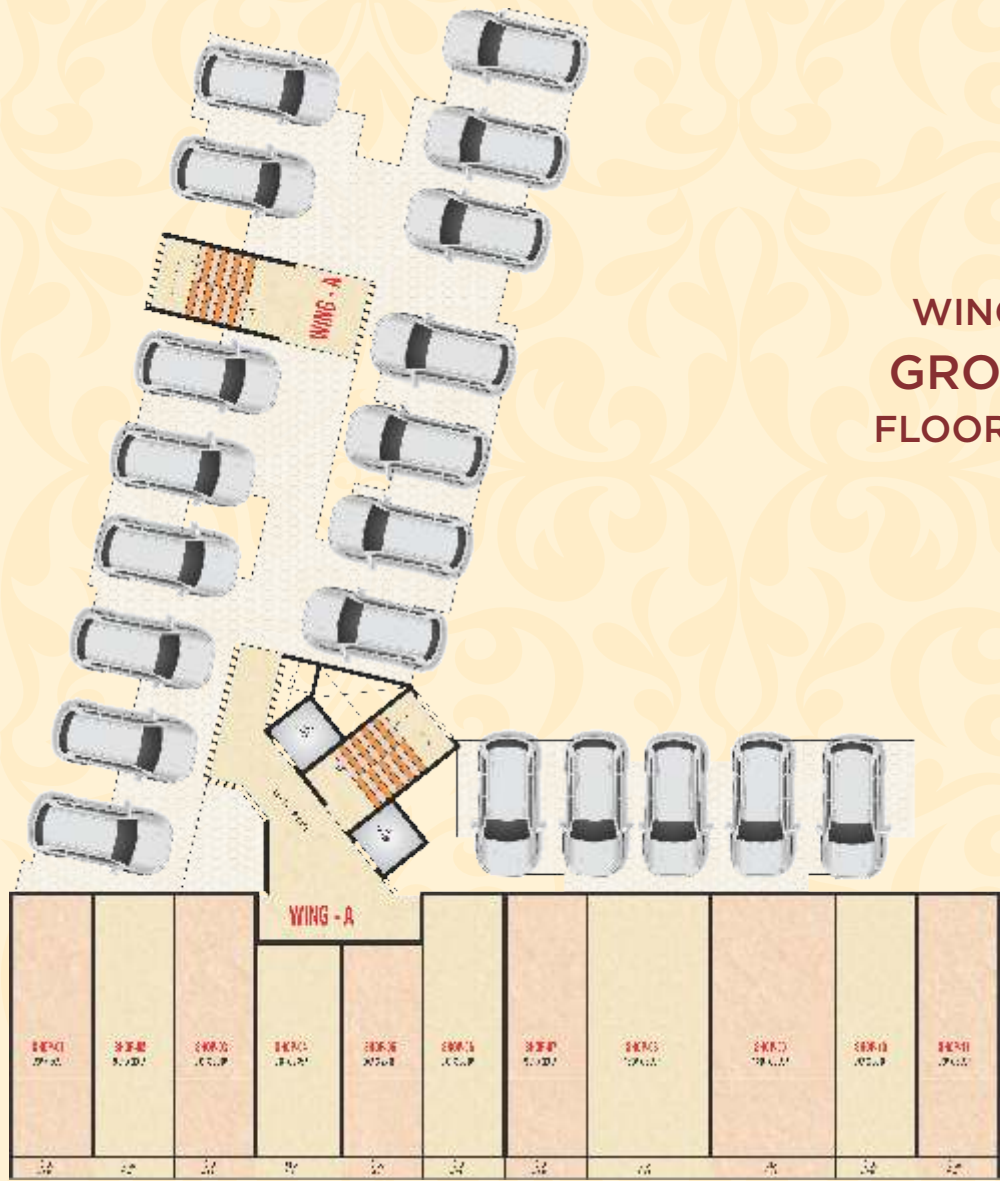
WING - A GROUND FLOOR PLAN