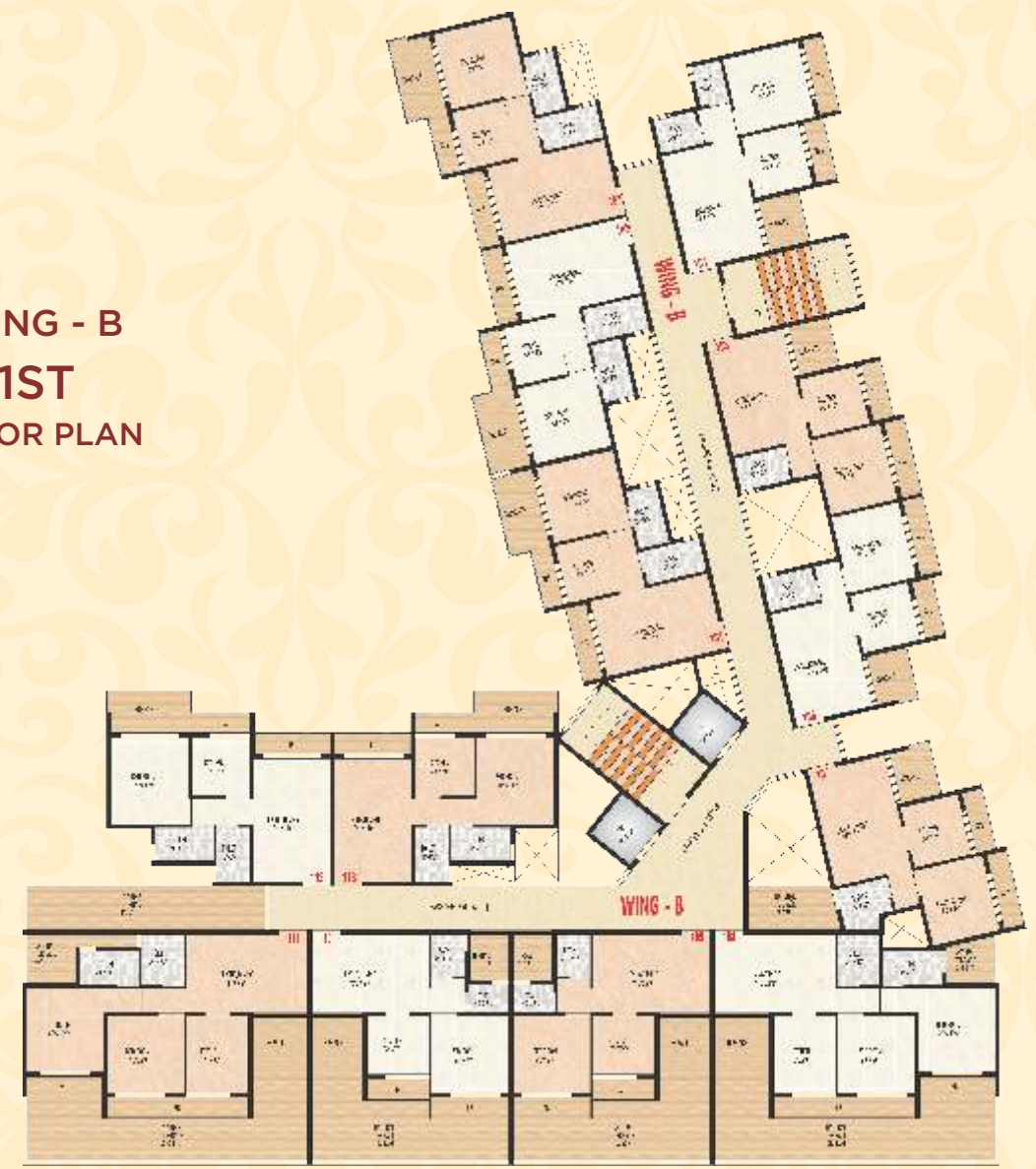
WING - B 1ST FLOOR PLAN