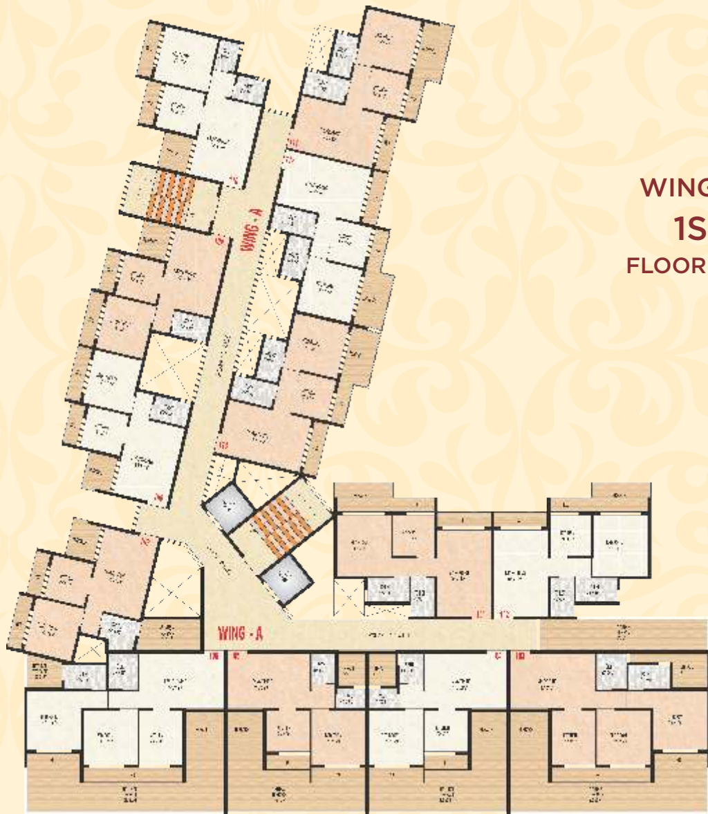
WING - A 1ST FLOOR PLAN