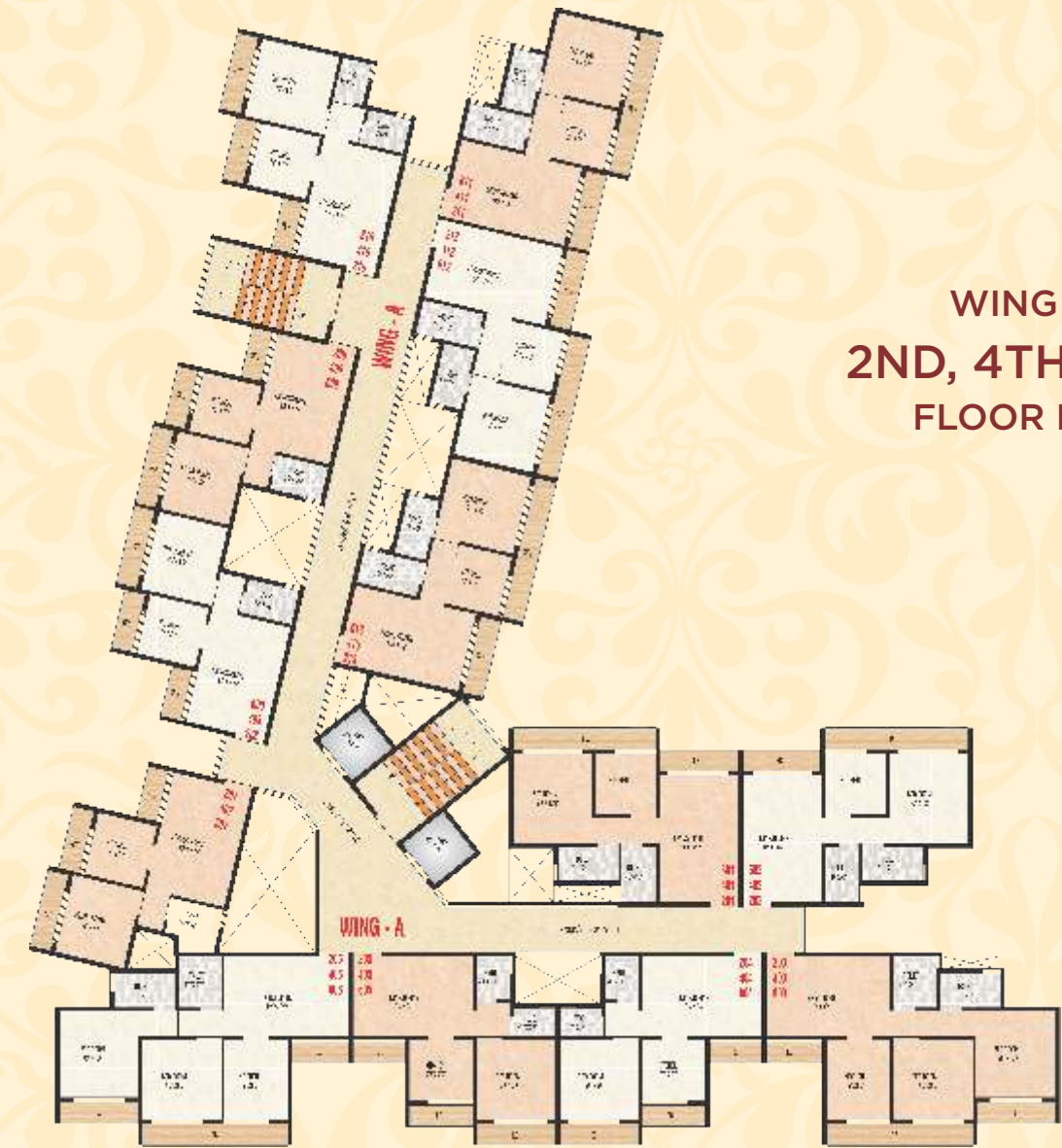
WING - A 2ND, 4TH & 6TH FLOOR PLAN